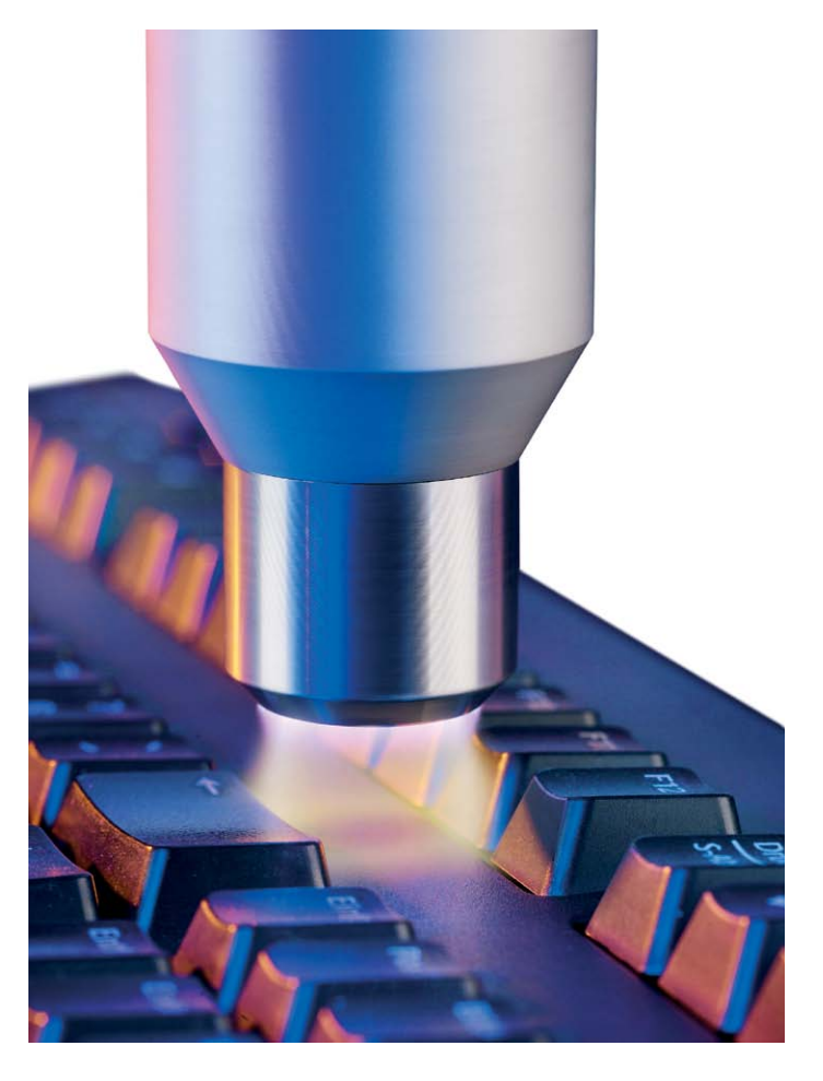
Figure 2. Electrostatic effects are the principal cause for the adhesion of dust. Atmospheric plasma-jet treatment allows extremely efficient cleaning before decorating.

Atmospheric jet-plasma is eco-friendly and, unlike gasflame treatment, there is no risk of explosion or overheating substrates due to complex component geometries. The nozzles are solely operated with air and high voltage. The green technology also is cost efficient. The process brings about the following effects on the material's surface: