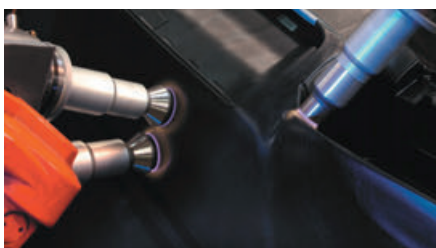
Fig. 1: Plasmatreat Robot-controlled patented Openair® plasma rotary nozzles scan the surface of the instrument panel with pinpoint accuracy, leaving out areas where no foam adhesion is required. This eliminates the need for masking.

Instead of using conventional flaming technology to manufacture the instrument panel, Peguform opted instead for a pretreatment with atmospheric pressure plasma. After completing a test phase and comparing the cost with building a flaming plant, the advantages for the manufacturer were plain to see. The decisive factor was the locally selective application afforded by the plasma