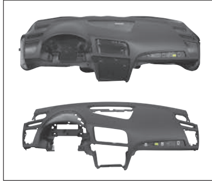
Fig. 3 and 4: Plasmatreat Top: Instrument panel after plasma treatment, slush skin and foam bonding and reverse-side weakening of skin in the airbag housing area. Bottom: Openings in the instrument panel have been milled out. The foam-backed slush skin can easily be removed from areas left untreated.

easily be peeled off. Areas in the substrate where openings are provided for inserting instruments are milled out separately (Fig. 3 and 4).