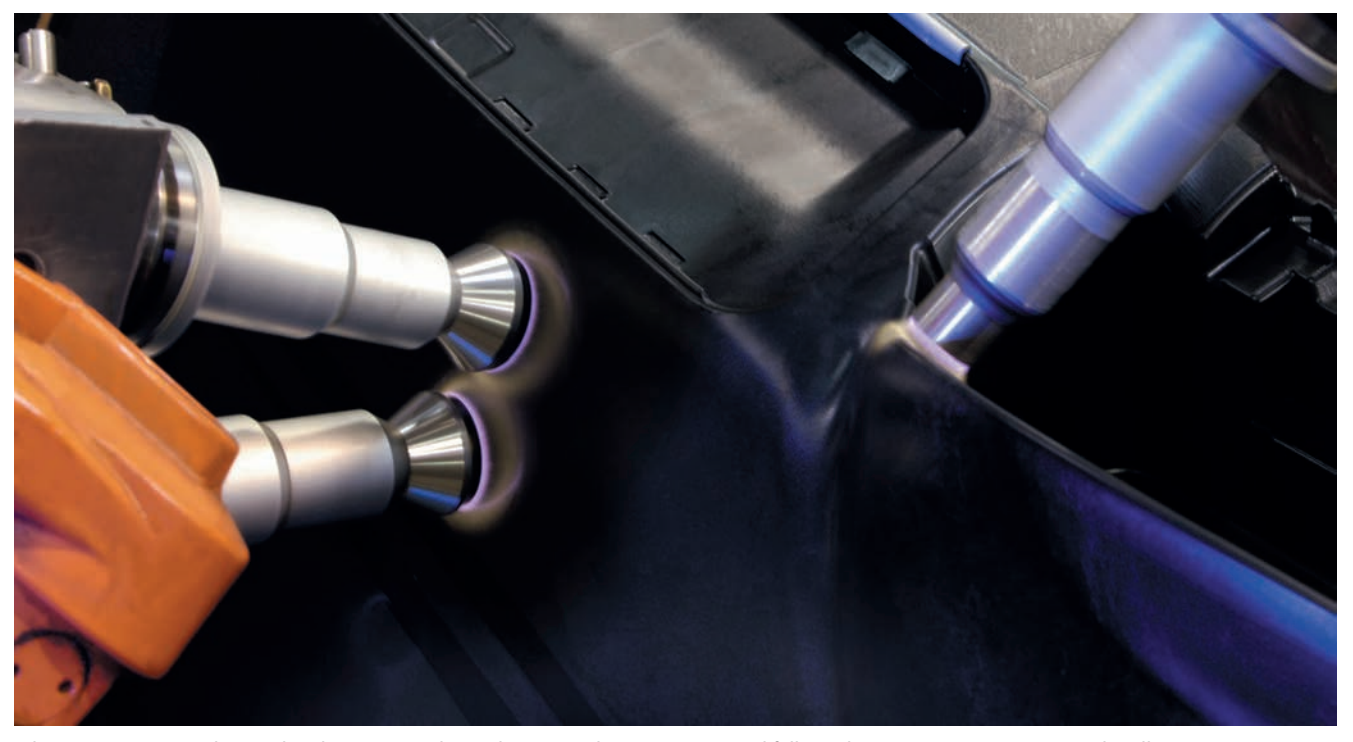
When using Openair-Plasma, the plasma jet works in a location-selective manner and follows the component geometry with millimeter precision. During the plasma treatment, very little heat is generated, so that the treated components remain dimensionally stable.

The use of recyclates confronts companies with new requirements in the processing, bonding, printing and labeling of materials and components. Atmospheric plasma technology, in which Plasmatreat GmbH has specialized, has established itself as a key technology: it often makes the use of recycled plastics possible in the first place – and also proves to be the means of choice on the way to more environmentally friendly, more resource-efficient production processes.