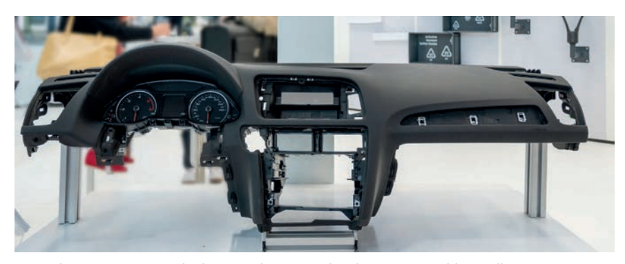
Fig. 4. The pretreatment with plasma makes non-polar plastics susceptible to adhesion processes and ensures a firm connection of the different, sometimes even incompatible materials, for example when laminating dashboards made of recycled materials with powder-sintered molded skins made of soft plastic.

The examples presented show how plasma technology supports companies not only with powerful and efficient