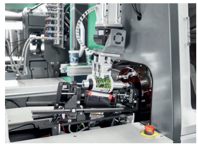
Fig. 2. A high surface energy is decisive for the wetting of the printing ink in UV digital printing and creates the prerequisite for good adhesion of the solvent-free printing inks.