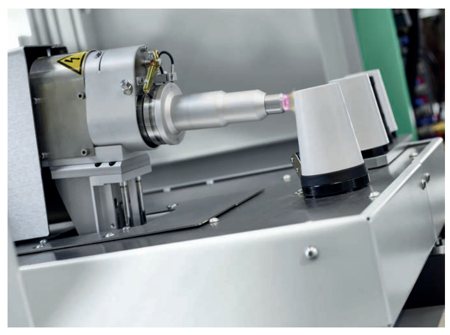
Fig. 1. The injection-molded recycling cup is treated with Openair-Plasma to increase the surface energy of the non-polar plastic.

Numerous industries are already using the power of plasma for a wide variety of processes. When using recycled plastics, plasma technology is once again of particular importance: due to the fact that the separation is not always 100 % pure, plastics are created in the recycling process that have (slightly) different properties than new goods, for example in terms of the quality of the surface.