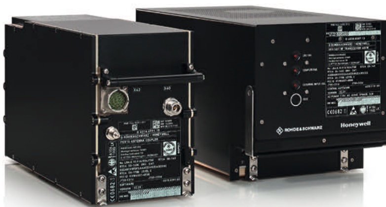
Fig. 4. The XK / FK 516 shortwave radio guarantees airborne communications: left, the FK 516 antenna tuning unit with built-in tuning control; right, the matching amplifier (figure: Rohde & Schwarz)

Even after this test, the results were conclusive: The electronics function perfectly and the coating adhesion is long-time stable. The plasma technology provided by Plasmatreat has proven its worth in all areas and under the most challenging conditions. The Memmingen-based airborne communications specialist has returned the borrowed equipment and pur-