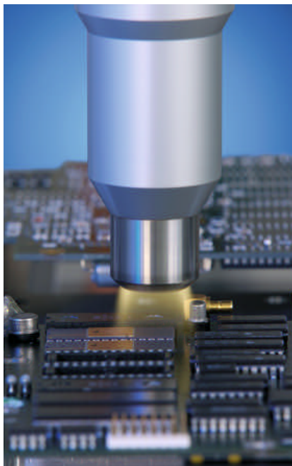
Fig. 1. The rotating Openair plasma jet strongly activates the plastic components in a matter of seconds without damaging the sensitive electronics

But finding the right pretreatment for these highly sensitive electronic components seemed almost impossible at first. Schneider: "Activation using a solvent-based primer was not an option for us. Partly because these substances are extremely harmful to the environment, and partly because they would incur enormous costs in terms of health and safety (e.g. explosion protection) and disposal." The electronic engineers also ruled out